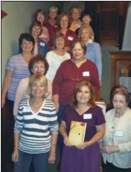
Celebrating 50 Books Read

Women's Cornerstone Book Club celebrated the reading of their 50 th book on September 20, 2011, where all enjoyed One Thousand White Women by Jim Fergus. The Book Club has been meeting almost monthly since the fall of 2006.